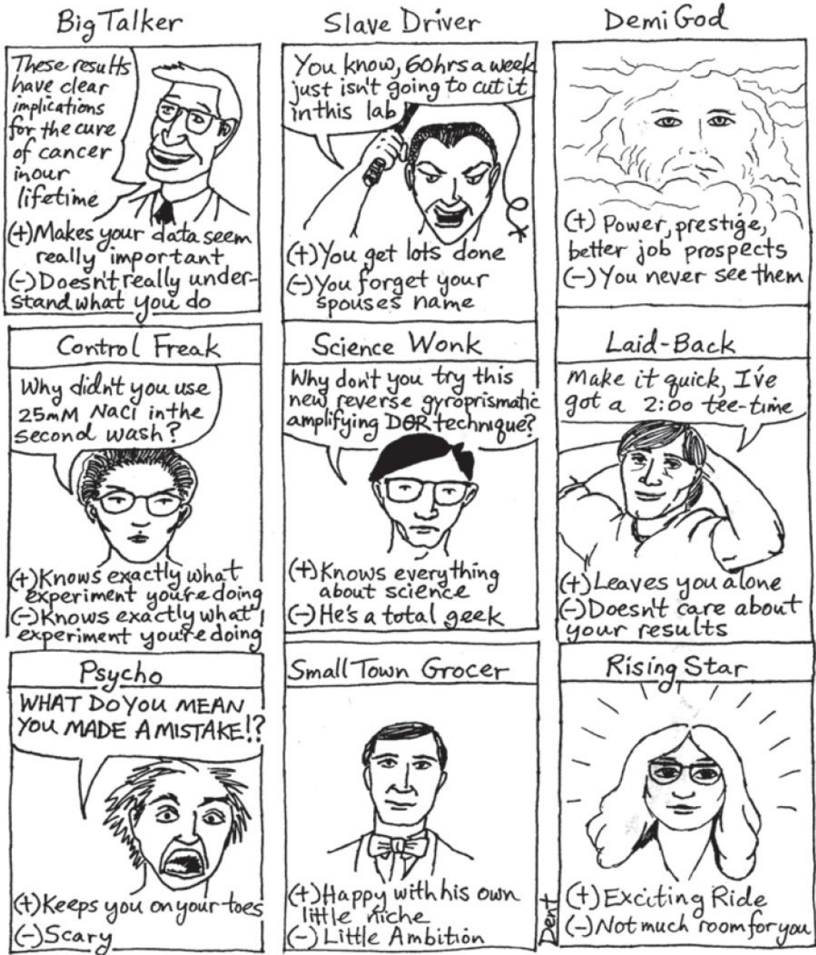
Figure 2. The nine types of principal investigator This cartoon was kindly provided by Alexander Dent, http://dentcartoons.blogspot.com .